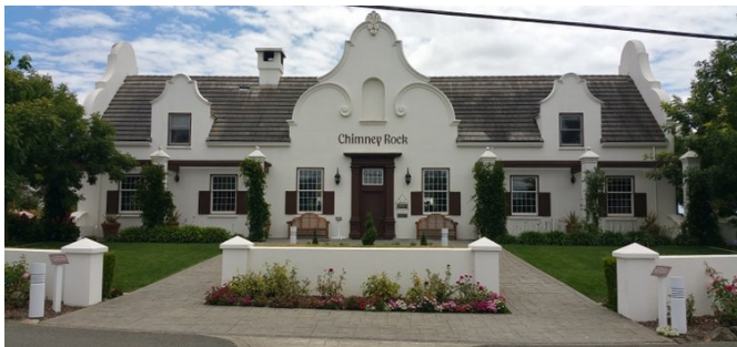
Chimney Rock Building