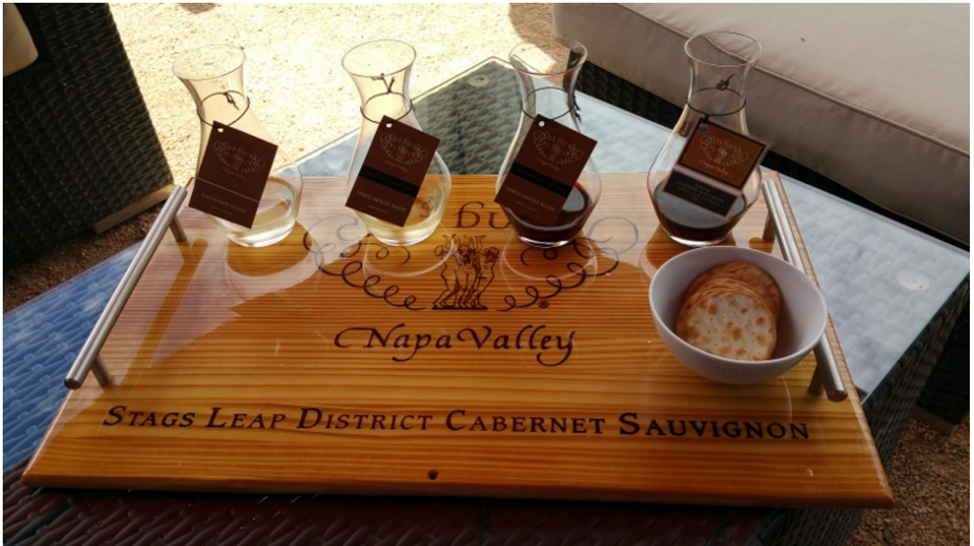
Clos Du Val Tasting