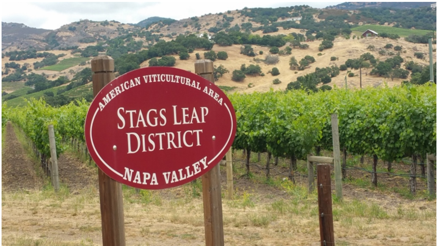
Stags Leap District