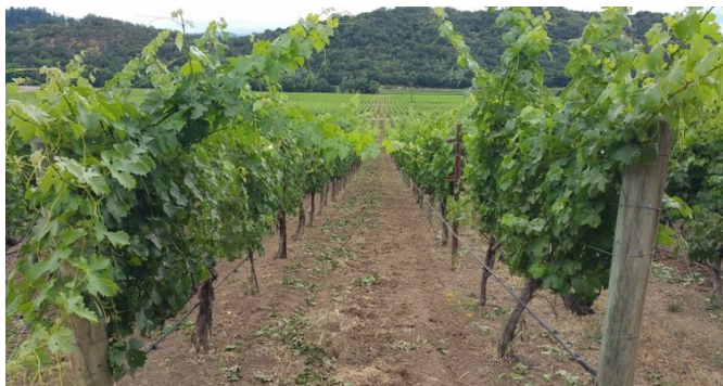
Stags' Leap Winery