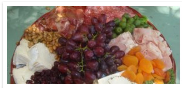
Clos Du Val Open House Offerings

Known worldwide for its Cabernet Sauvignon, the Stags Leap District produces wines critically acclaimed for their lush fruit and soft tannins with complex layers of flavor. The appellation is bounded on the east by the towering Stags Leap Palisades, to the west by gently rolling hills and the Napa River, to the north by the Yountville Cross Road, and to the south by low-lying flatlands.