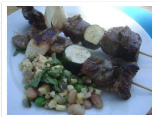
Lamb Skewers and Sweet Corn Succotash from Foodshed Take Away

Steltzner Vineyards – Since 1965, the Steltzner family has been dedicated to producing wines of exceptional quality. While the former winery building, production facility and some vineyards were sold in 2012, the family retained over 30 acres in the Stags Leap District and continues to produce wines. The V2V Open House tasting took place on their vineyard estate, poolside, overseeing the Pool Block vineyard.