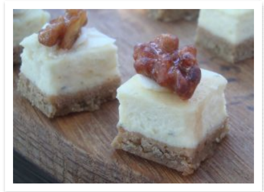
Savory Cheesecake Bites

At the Vineyard to Vintner Open House, the Taylors offered a buffet of options including a selection of Cheeses, Macarons, and Savory Cheesecake Bites. They also prepared gourmet Grilled Cheese sandwiches including our favorites: Redwood Hills Chevre, Dried Apricot and Shallot Compote on Sourdough with Pink Peppercorn Butter and; White Cheddar, Tomato, and Applewood Smoked Bacon on Model Bakery Bacon Bread with Herb Butter. 5991 Silverado Trail, Napa (707-255-3593) [wines primarily sold online or over the phone]