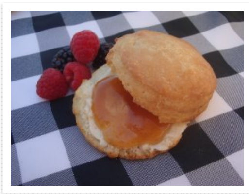
Buttermilk Biscuit with Apple Jam

On May 1, Silverado Vineyards hosted an awesome Vineyard to Vintner Brunch where we enjoyed a selection of wines paired with the exceptional brunch fare from Michelin-starred Meadowood Resort served on the winery's umbrella-filled plaza.