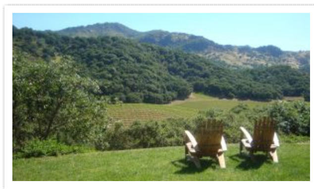
Stags Leap District, at Taylor Family Vineyards

Have you been to Napa Valley's Stags Leap District recently? A few weeks ago, we had the pleasure of attending the region's Vineyard to Vintner event, a weekend of fun opportunities to taste the appellation's world-class wines while mingling with the winery owners and winemakers in their historic wineries (which in some cases meant we were actually visiting their homes).