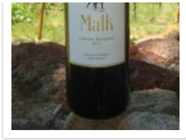
Malk Family Vineyards

their old-fashioned tree swing. 5850 Silverado Trail, Napa (858-795-0699) [wines primarily sold online or over the phone]