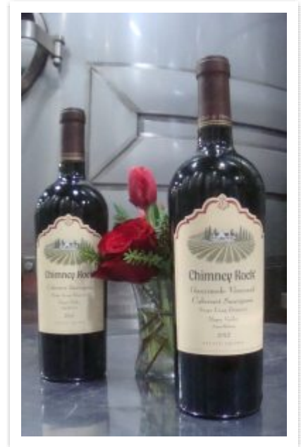
Chimney Rock Winery

Clos Du Val – Started in 1972, the winery showcases Splendor, Mirth, and Joy ( The Three Graces, the daughters of Zeus ) on their distinctive labels. In the last few years, Clos Du Val has begun focusing almost exclusively on making estate-grown wines, with an emphasis on the exceptional Stags Leap District Cabernet Sauvignons that first catapulted them to fame.