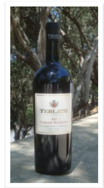
Terlato Family Vineyards