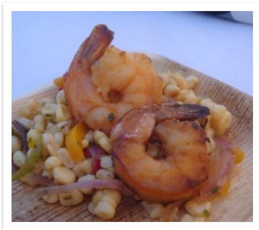
Grilled Prawns with White Corn at V2V Brunch

We completely enjoyed this year's Stags Leap District Vineyard to Vintner weekend, and it truly was an "unparalleled appellation experience." We enjoyed outstanding wines, delicious food, gracious hosts, and a sneak preview of the appellation's upcoming releases.