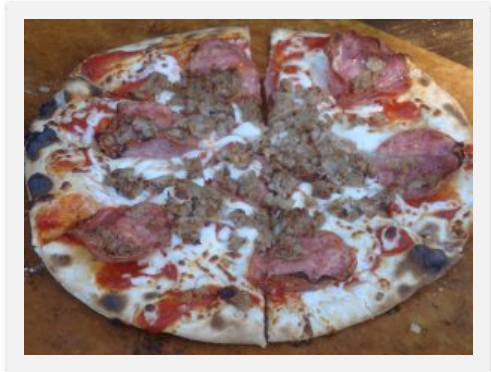
Pizza from Napa Valley Crust

The linchpin of Vineyard to Vintner (V2V) weekend is the “Back-Stage Pass” good at up to 16 Open Houses on April 29. Begin at the starting point of your choice and then explore along the Silverado Trail at leisure. Enjoy wines and nibbles as you meet and mingle with winery owners and winemakers ( sometimes actually at the owners’ homes ). You can find the full program here but some of the special experiences this year include: