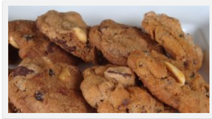
Seis Primas Cookies