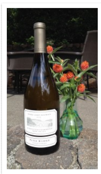
Pine Ridge Vineyards Le Petit Clos Chardonnay

Known worldwide for its premium wines, the Stags Leap District produces