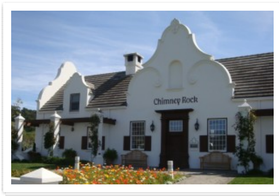
Chimney Rock Winery

Other wineries participating in the Vineyard to Vintner Open Houses are Baldacci Family Vineyards , Chimney Rock Winery , Lindstrom Wines , Odette Estate Winery , Robinson Family Vineyards , Stag's Leap Wine Cellars , Steltzner Vineyards , and Terlato Family Vineyards . For a helpful map of the Stags Leap District and its wineries, please go here .