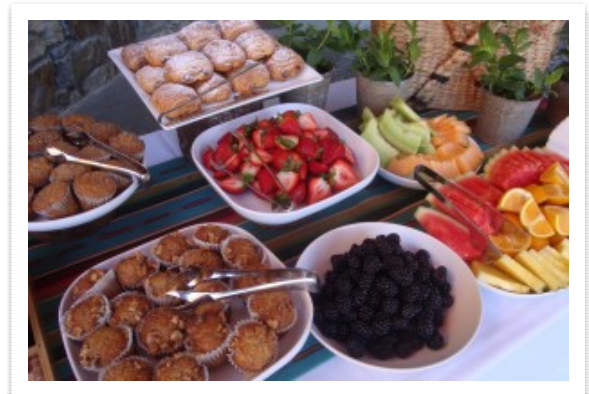
Vineyard to Vintner Brunch

advantage of a Sneak Preview of the upcoming Cabernet Sauvignon portfolio for the region, the 2013 Stags Leap District Appellation Collection ( which isn't scheduled for an official release until October 15, 2016 ). Some of our