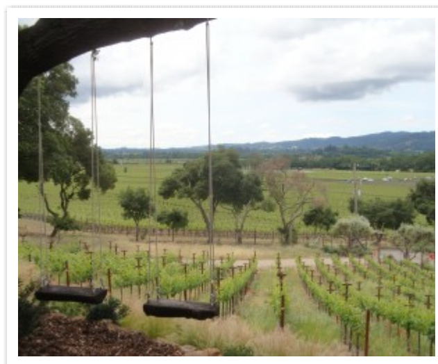
View of Stags Leap District from Malk Family Vineyards

If you're a fan of Stags Leap District Cabernet Sauvignons, you might want to venture to Napa Valley for the 2016 Vineyard to Vintner event taking place the weekend of April 30 and May 1. You can stop by multiple Winery Open Houses ( including wineries that only open to the public for this event ) on Saturday and then attend a spectacular Brunch on Sunday which also provides a comprehensive peek at the upcoming 2013 Cabernet Sauvignon releases.