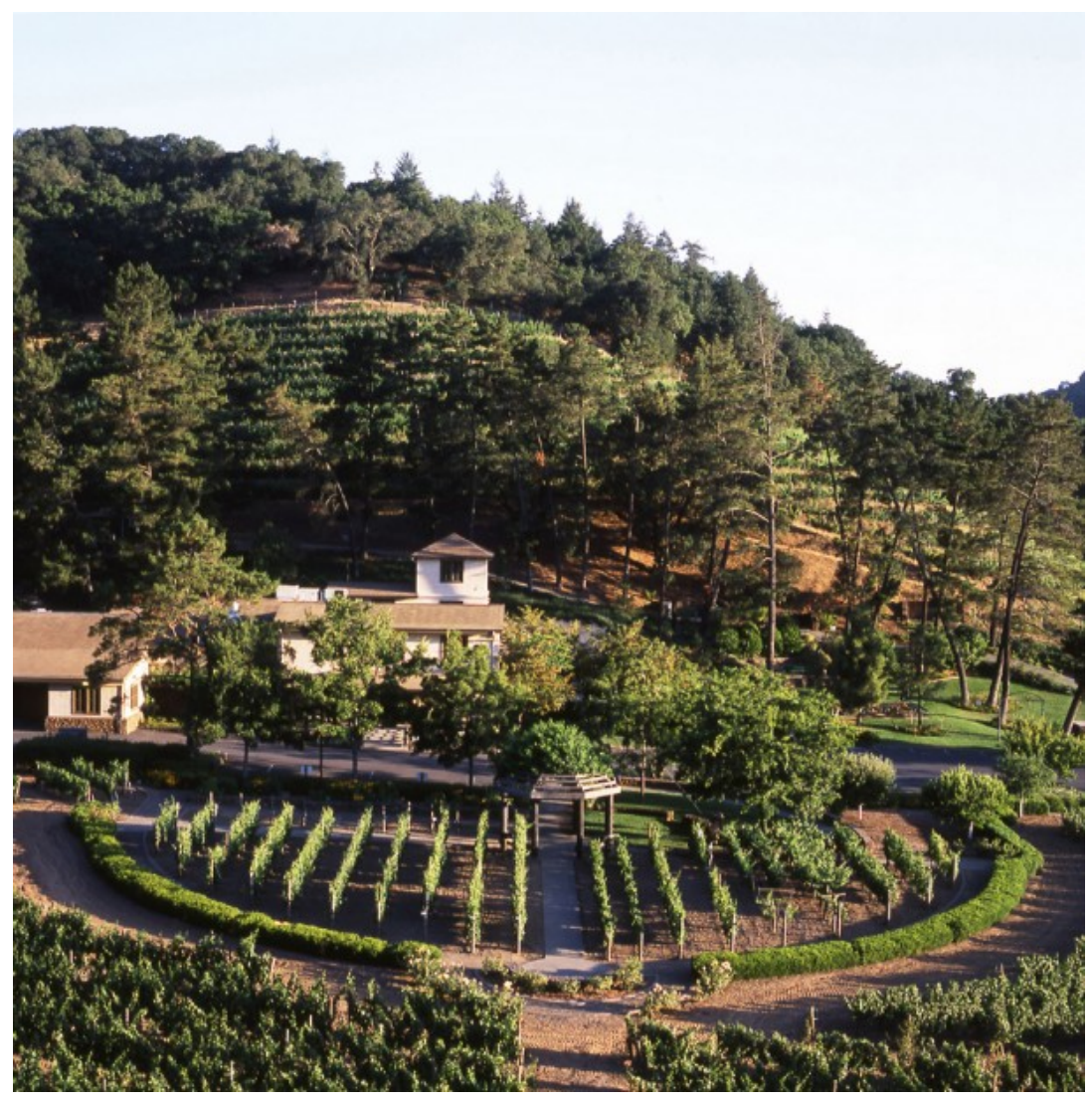
Pine Ridge Vineyards, Napa Valley