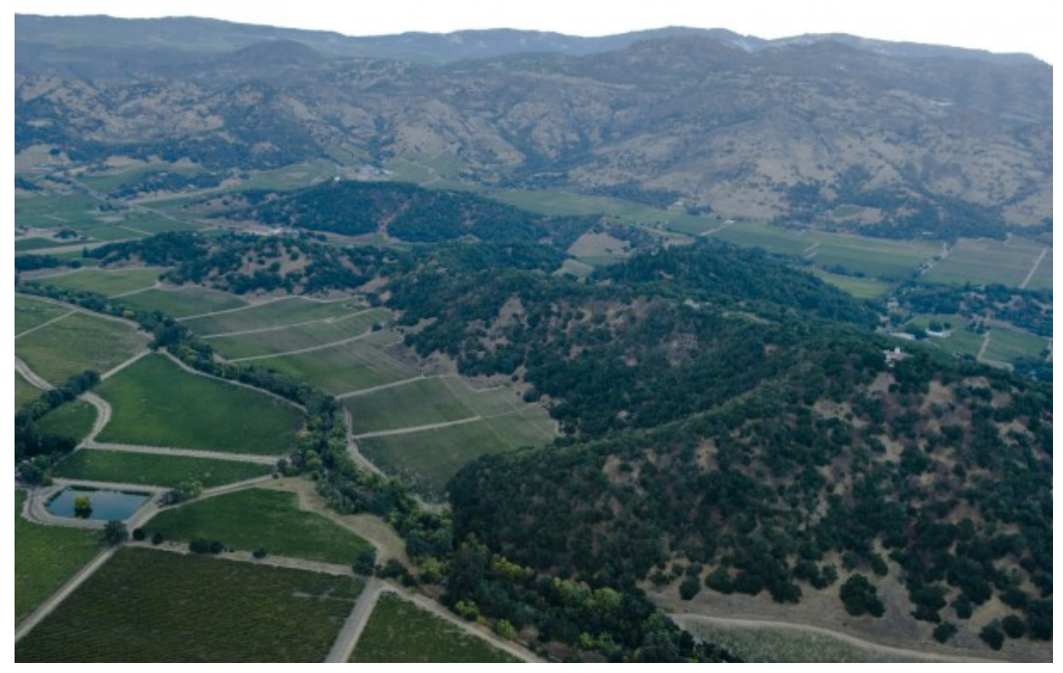
Birds eye view of the Stags Leap District AVA in Napa Valley.

As spring rolls in, wine country events, tastings and winemaker dinners kick into high gear. Over the next few months Stark Insider will be on location in Napa, Sonoma, and other parts of beautiful Northern California, to capture sights and sounds: the people, places and stories. Tough work, we know! But if you're like us, we just must scratch our eternal wanderlust, and explore.