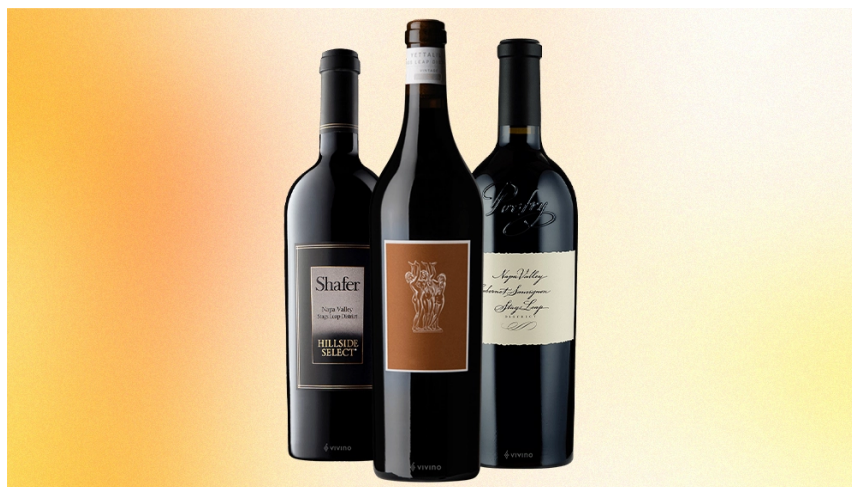
Shafer, Clos du Val, Cliff Lede

Wine grapes were first planted in what is now the Stags Leap District AVA in the 1870s, when Silverado Trail was still plied by farmers on horseback rather than revelers in party limos off to visit their favorite Napa Valley wineries. The first Cabernet Sauvignon was planted here in 1961, and since that time the “valley within a valley,” as it has been called, has become renowned for Cabernet Sauvignon and red blends known for their power and grace.