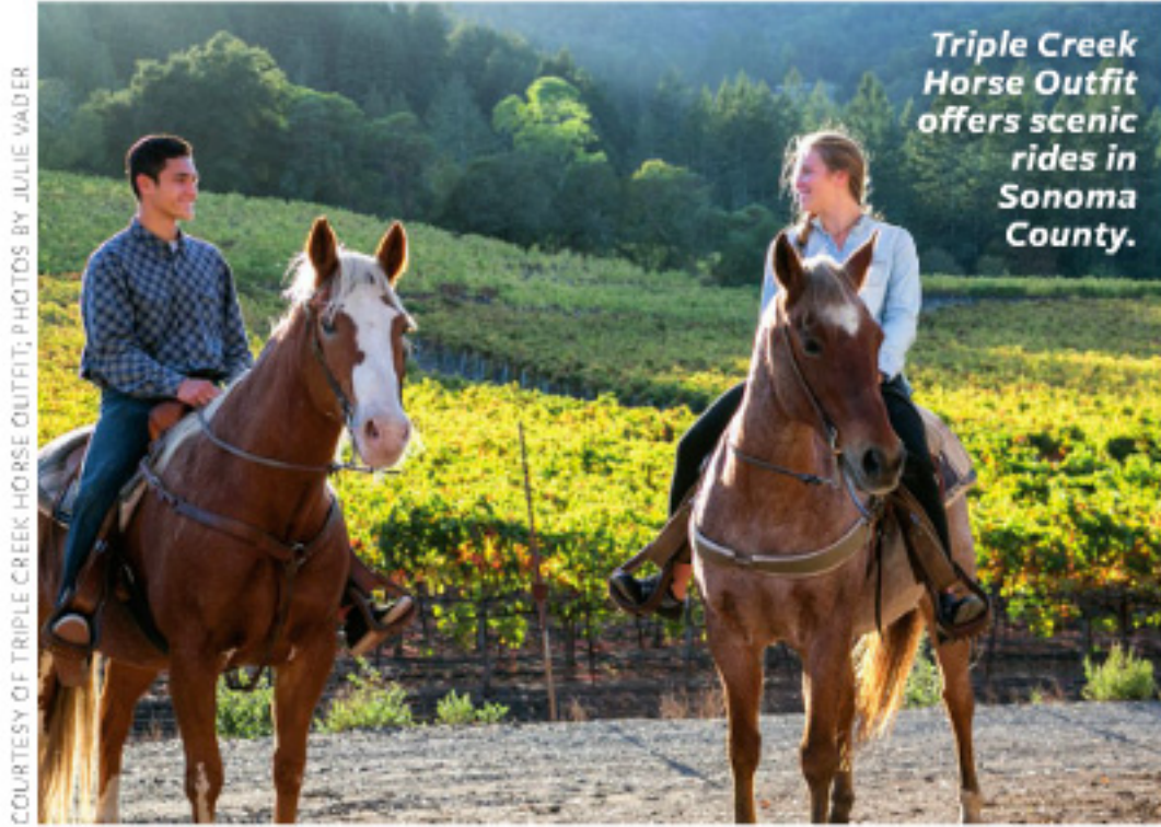
Triple Creek Horse Outfit offers scenic rides in Sonoma County.